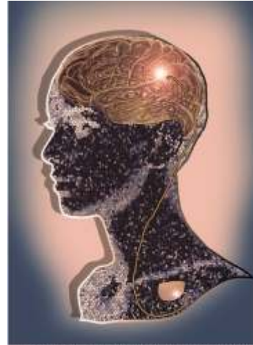
DEEP BRAIN STIMULATION USING A BRAIN PACEMAKER

singly or in combination. Surgical treatment includes Deep Brain Stimulation (DBS) and Lesional (Thalamotomy, Subthalamotomy, Pallidotomy) . The choice of treatment depends on the nature and cause of movement disorders.