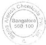
Signatures and contact details of Authorised Signatory (Research team)